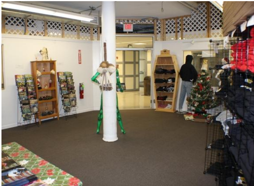
View from Unit, toward lobby