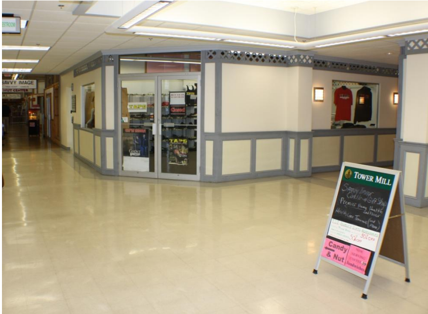
Subject Unit, view from lobby entrance