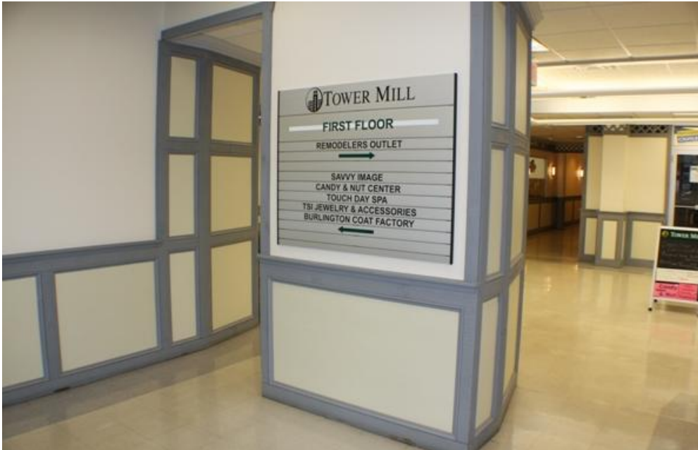
Signage at entrance