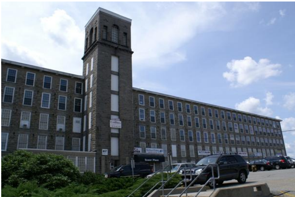
Exterior of Building

HARTEL REALTY 230 Jones Road, Unit 6, Falmouth, MA 02540 Main: (508) 444-0172 ♦ Cell: (617) 256-3169 ♦ Fax: (508) 548-2995 email: greg@hartelrealty.com www.hartelrealty.com