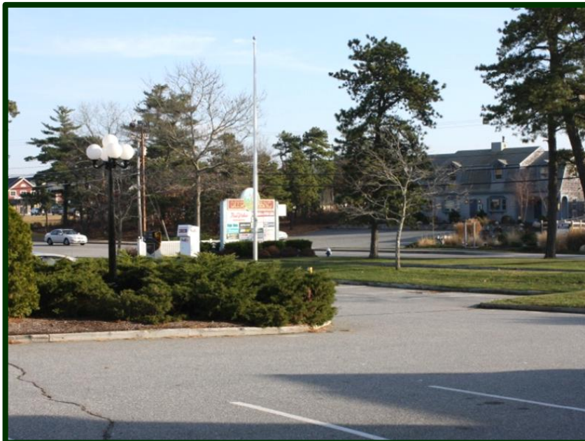
View of complex entrance

HARTEL REALTY 230 Jones Road, Unit 6, Falmouth, MA 02540 Main: (508) 444-0172 ♦ Cell: (617) 256-3169 ♦ Fax: (508) 548-2995 email: greg@hartelrealty.com www.hartelrealty.com