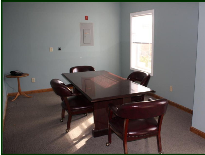
Interior of Unit