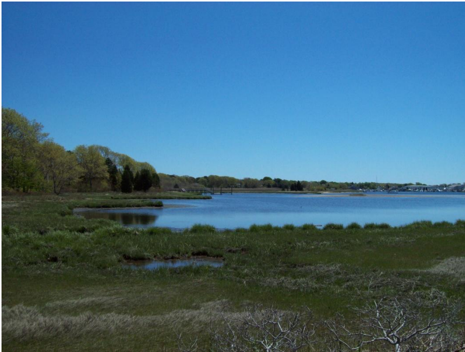
End of Seapuit Road