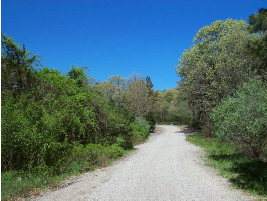
Driveway from Road