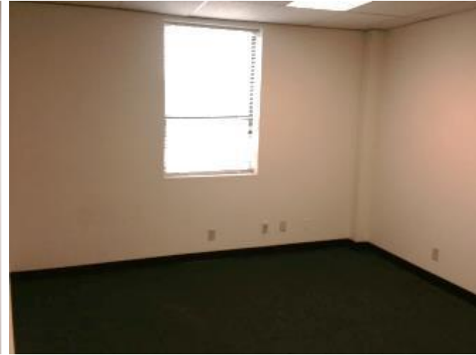
Typical Unit View