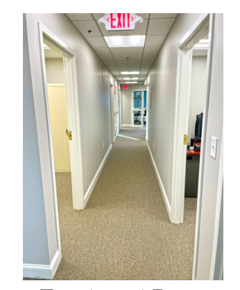
Treatment Room Hallway