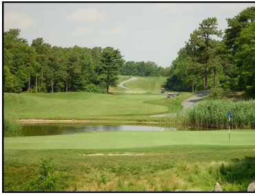
29 Hill & Plain Road