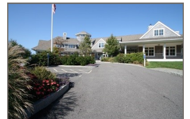
The Golf Club of Cape Cod Clubhouse