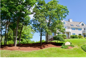
71A Fairway Pointe Rd

The property is located on a quiet street in the highly sought after Ballymeade Estates. This subdivision consists of superior, luxurious homes with gated entrance and security, many amenities and breathtaking views from certain elevations of distance water views. There is a semi-private golf course which welcomes the public and a private golf course for members only, each with its own State of the Art Clubhouse.