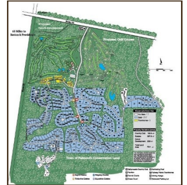
Developmental Map showing Ballymade subdivision & Golf Courses