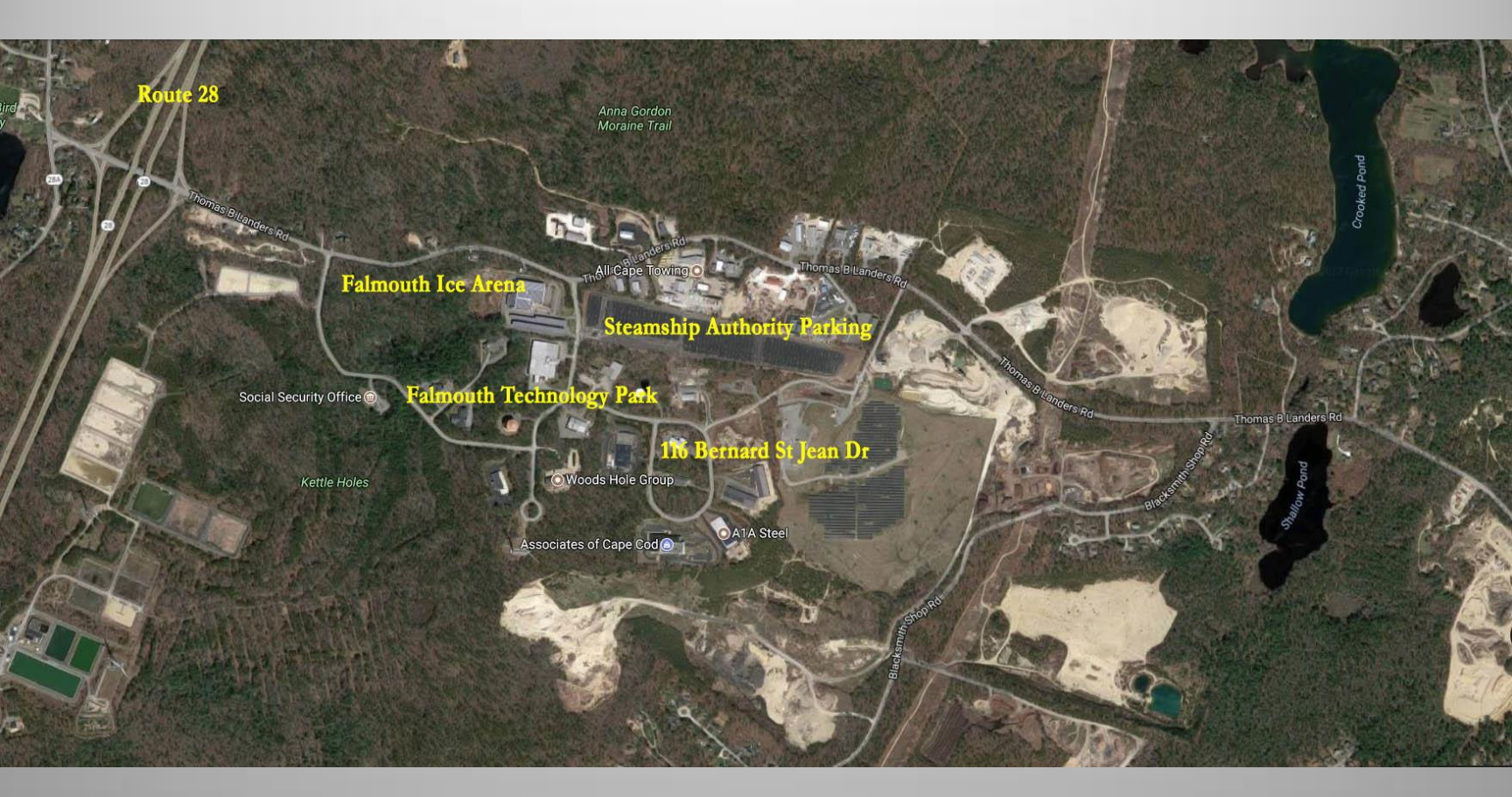
116 Bernard St. Jean Drive Unit 7-7R