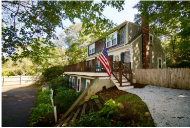
37 N Falmouth Hwy

The property is located on Route 28A in the highly sought after North Falmouth area. Updates include windows, roof and flooring. Kitchen opens up into living room area with gas fireplace., first floor bedroom, dining room, laminate flooring throughout and carpet in the bedrooms. The home includes an additional 330 SF entry level family room that is not included in the property record. An oversized 12 x 30 deck is great for outdoor entertaining and watching views of the sunset. Back yard is fenced with lots of privacy. Property is a short drive to Falmouth’s Main Street, schools and Falmouth’s beautiful beaches.